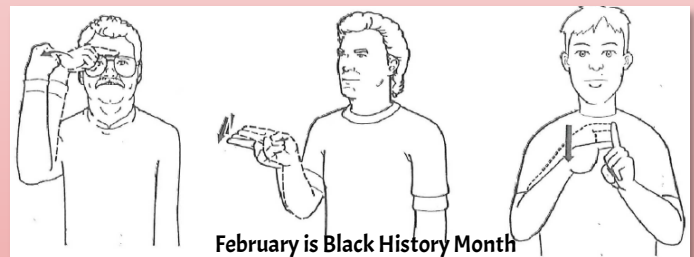
February is Black History Month